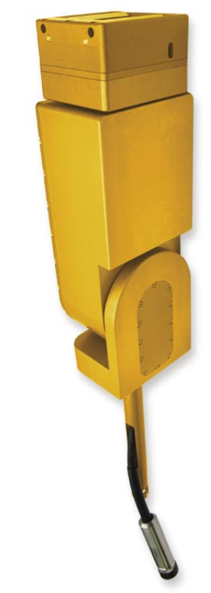
The Pan-Tilt Arm accommodates all underwater laser scanners by Newton Labs.