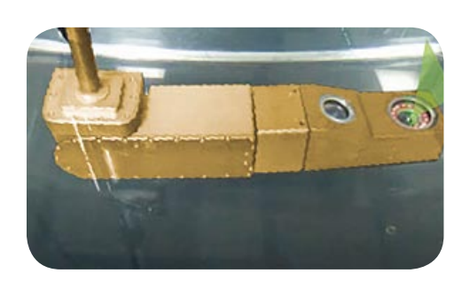
The flexible PT200UW features an operation range of 185 degrees at the "elbow" and infinite rotation at the "wrist."

Two-axis directional control of the Pan-Tilt Arm is achieved with a joystick that is installed on the front panel of the laser scanner control consoles. Pan and tilt speed is controlled with an adjacent rheostat knob.